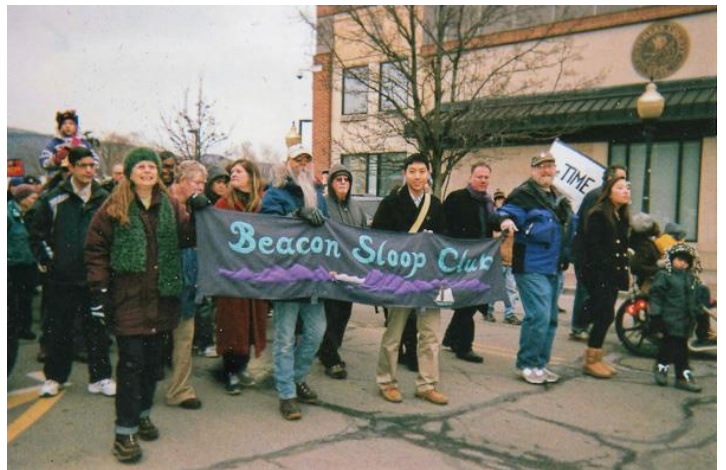
The Sloop Club came out in force for last year's MLK Day Parade