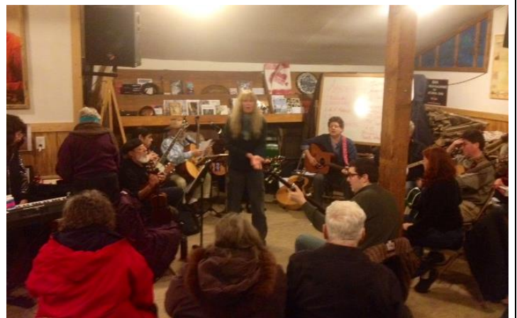
Rehearsal at the Sloop Club

NEXT EXEC. COM. MEETING IS Tuesday, January 27th 7:00 p.m.